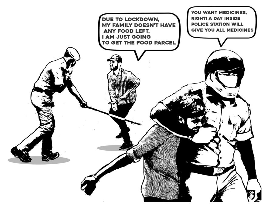
Image C6.1 "Militarization of quarantine/lockdown."

control the virus, resulting in large numbers of arrests, an intensified military presence at checkpoints, and contact tracing run by intelligence agencies (Human Rights Watch 2020a). Across the Americas and Europe, incidents of racial discrimination, harassment, threats, and physical violence against people of Asian descent have increased (Human Rights Watch 2020b), sometimes stoked by government officials and politicians blaming Asian immigrants for the spread of the virus.