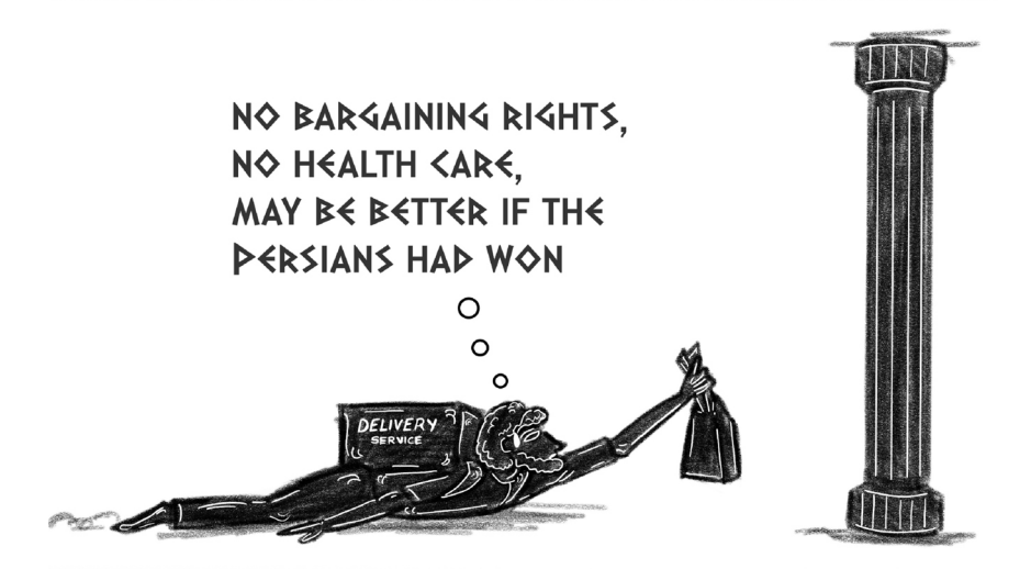
Image C2.2 Over 2,500 years ago a message-courier ran scores of miles to proclaim Greek victory over the Persians, and then promptly died. Are gig workers our new marathon couriers?

There are promising developments and signs that gig workers are gaining the power to ensure their contracts with these corporations have some protections and permanency. One notable situation where this is taking place is the UK in the court case Uber v Aslam . This case dealt with the question of whether Uber drivers, such as Yaseen Aslam, had been self-employed, or were instead "workers' with statutory rights to a minimum wage and paid holidays" (Dukes