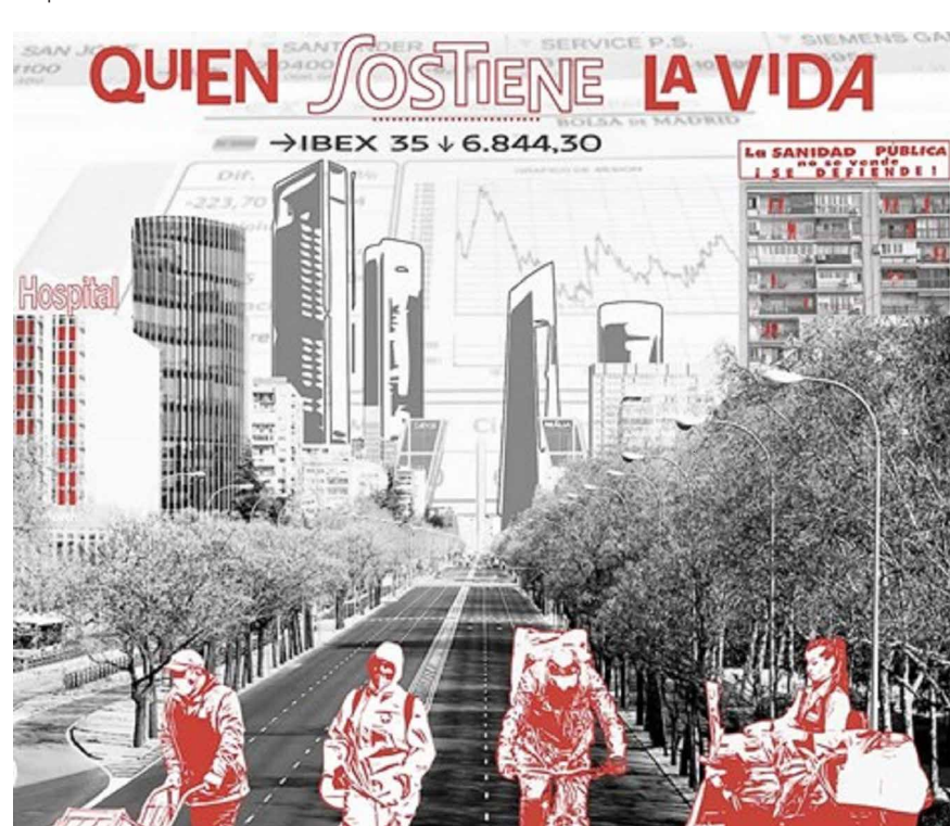
Image C2.3 "Quien sostiene la vida" / "Those who sustain life" (2020).