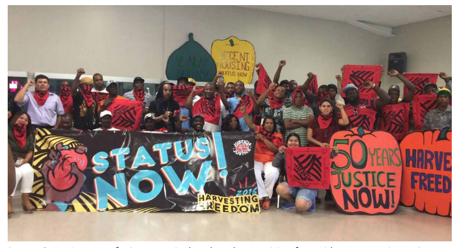
Image C2.4 A group of migrant agricultural workers petition for residency status in 2016.

highlighted these inequities that were previously easily overlooked, while also underscoring the crucial role that temporary migrant agricultural workers play in ensuring food security. It is the duty of local, national, and global authorities (the International Labor Organization (ILO), the International Organization of Migration, and the Office of the UN High Commissioner on Human Rights) to address major flaws in the structure and implementation of the Temporary Foreign Worker Programs around the world and to finally break a cycle of perpetuating injury, inequity, and exploitation (Landry et al. 2021).