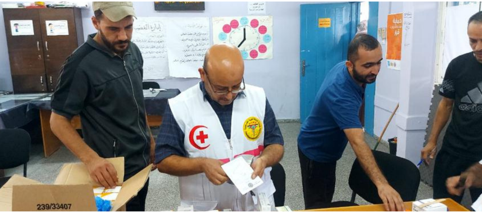
PMRS OUTREACH TEAMS IN GAZA PROVIDE MUCH NEEDED MEDICATIONS TO THOSE WITH CHRONIC CONDITIONS AND RECENT INJURIES - SUPPLIES ARE DANGEROUSLY LOW