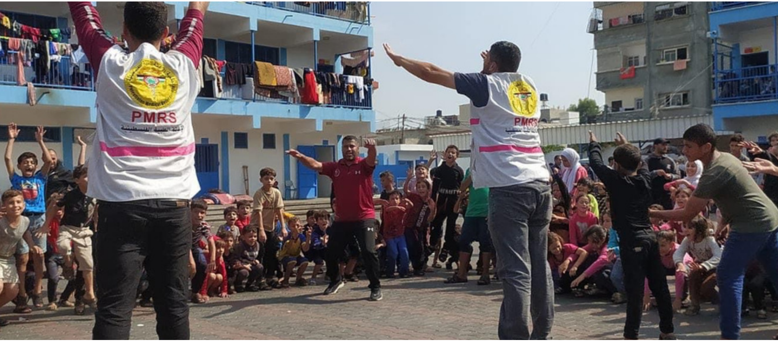
PMRS OUTREACH TEAMS IN GAZA PROVIDE RECREATIONAL ACTIVITIES FOR MENTAL HEALTH FOR CHILDREN AT UNRWA SHELTERS